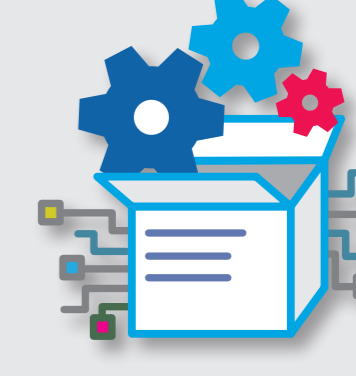
Engineering and Production