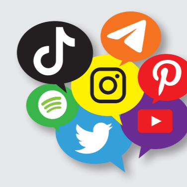
Media and Communication